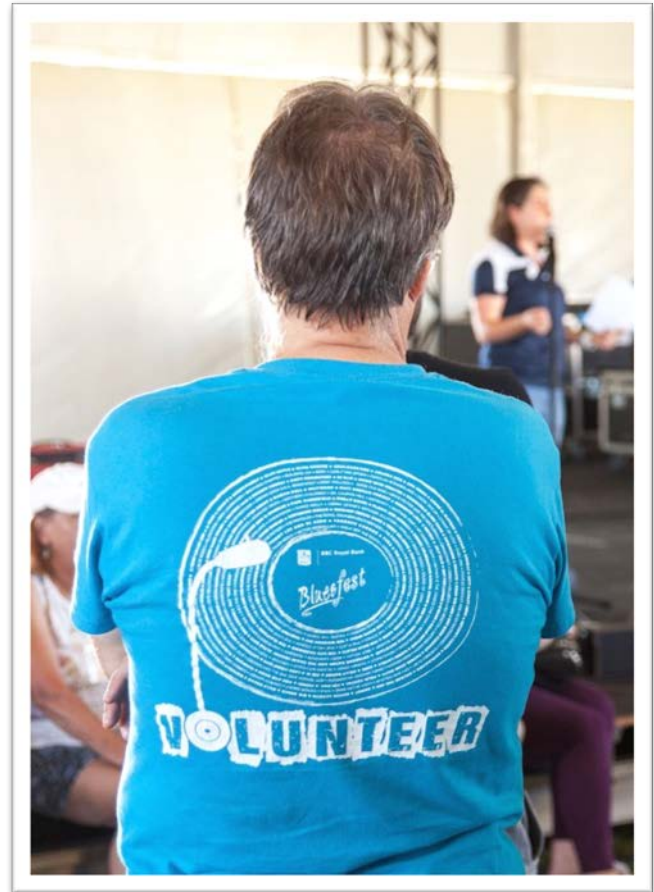
Volunteer orientation night was a great success!

“We would like to begin by acknowledging that the land on which we gather is the traditional and unceded territory of the Algonquin nation.”